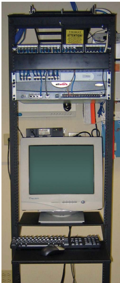
The Allworx 10x is the hub of Abram Law Group's technical infrastructure, providing protection and networking capabilities.