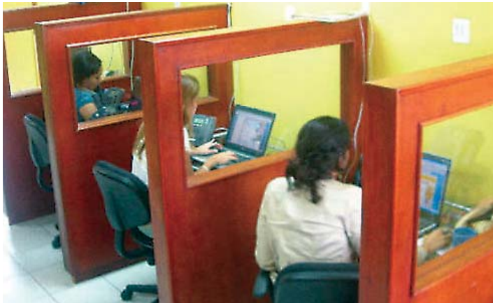
Fame 1 employees using the Allworx System.