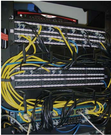
The Allworx 6x is shown above connecting to the Internet and PBX phone system to create the hub for Patrick Motors communication system.